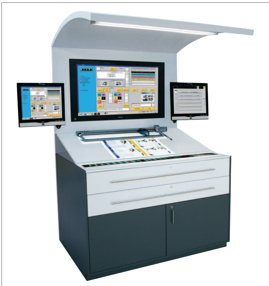
InkZone Loop is compatible with almost all press consoles.

So, once the operator checks the color results and the recommended press adjustments, at the touch of a button the ink keys for all printing units can be adjusted automatically. This can lead to results that are clear: a significant reduction in makeready and run waste, higher overall color quality, and consistent, stable production runs.